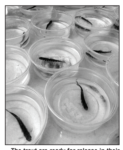
The trout are ready for release in their individual containers.