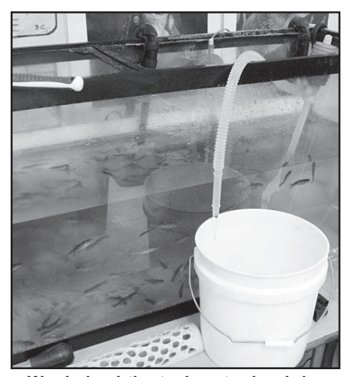
We drained the tank water level down in order to net more than 250 brook trout to transport to North Park.