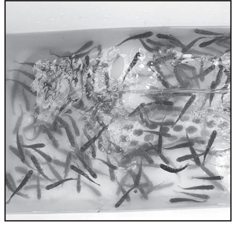
The fingerlings are transferred into an aerated cooler for transport.

It was a great culmination of a great project!