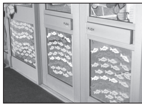
After students nicknamed their fish, we used trout cut-outs on the school windows to display our unique "Finny Friend" names.

Preparations began for the big trout release at the Latrobe Grove by the Boat House. First, we poured the trout from the container into a larger cooler for display.