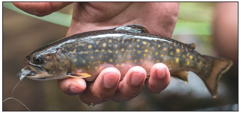
A key part of the Pennsylvania Brook Trout Odyssey was research conducted on the commonwealth's state fish.

Deadline to register is Monday, Aug. 27.